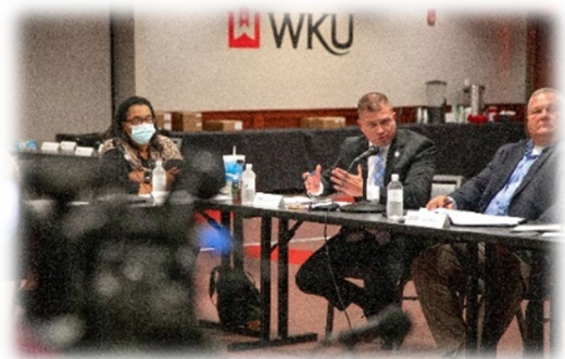
The Search Warrant Task Force met at Western Kentucky University for the September meeting.

On September 14, 2021, the Search Warrant Task Force met in Bowling Green. The Securing Committee presented to the Search Warrant Task Force at this meeting.