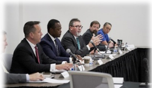
Members met at Eastern Kentucky University for the June meeting.

The Search Warrant Task Force held its June meeting in Richmond on June 21, 2021. The meeting included a presentation from the Kentucky Department of Criminal Justice Training.